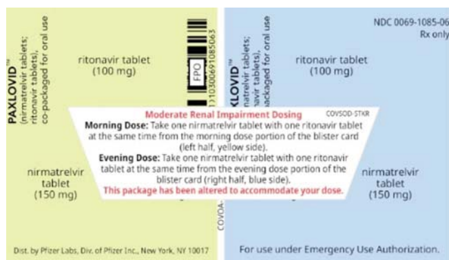
Figure 2. A pre-printed sticker with dosing instructions (provided by the manufacturer) is placed over the empty blisters where the nirmatrelvir tablets were removed for patients with moderate renal impairment.

Providers must report all serious adverse events or medication errors potentially related to Paxlovid to the FDA MedWatch reporting program ( www.ismp.org/ext/609 ), which is mandatory for medications available under an EUA. Please also fax a copy of the MedWatch form to Pfizer (866-635-8337). ISMP also asks providers to report errors to the ISMP National Medication Errors Reporting Program (ISMP MERP, www.ismp.org/MERP ).